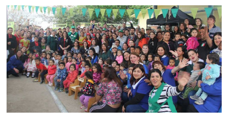
This past September 27, TMLUC volunteers in Chile installed new recreational playgrounds benefitting 112 children who attend the Génesis Kindergarten, 'in the San Joaquín Commune in Santiago.